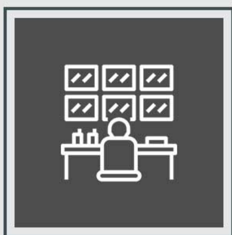
24/7 Security & Surveillance