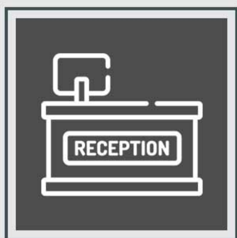
Concierge & Reception