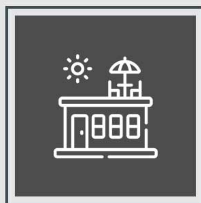
Rooftop Sitting Area